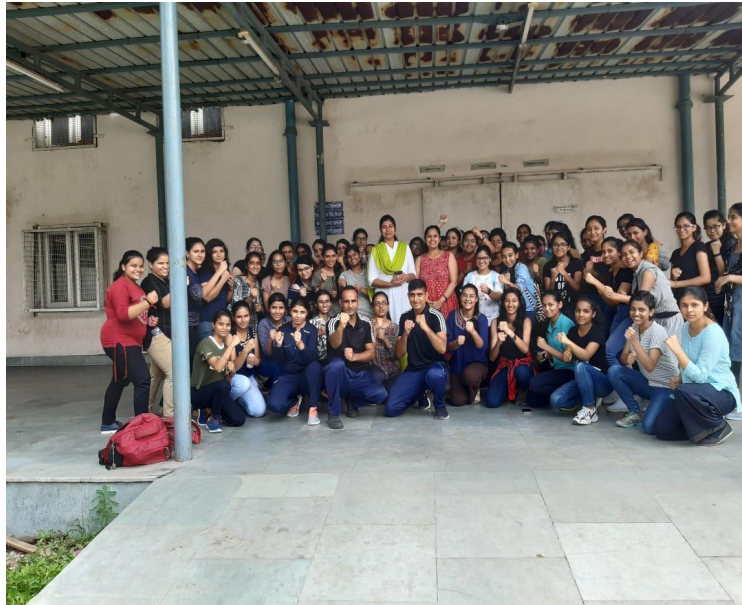
Participants of Self Defence Workshop (CSE, IT and ASH)