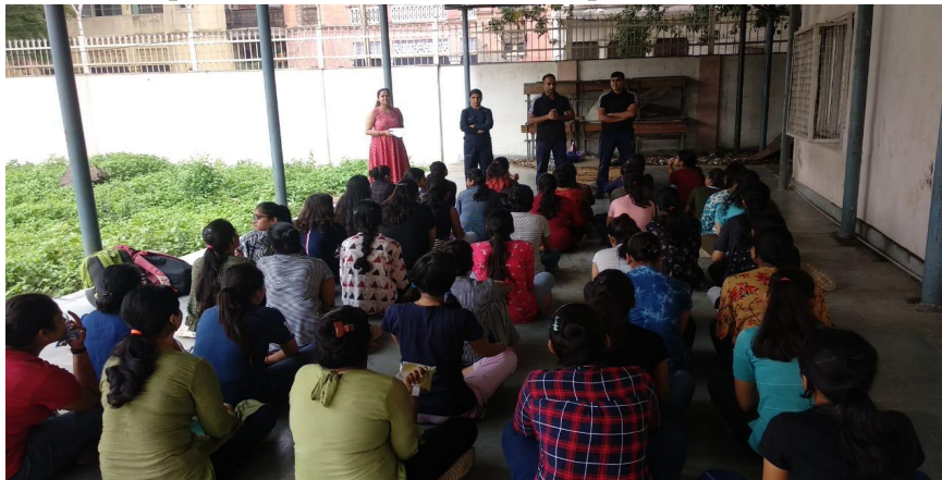
Participants during Session